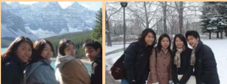
2002. Moreover, Calgary is one the most important cities in Western Canada and located in the richest state in Canada, Alberta. Therefore, we are lucky to be here.

in the Haskayne School of Business at The University of Calgary. It is ranked in the top three of all business schools in Canada. Over here, there is almost everything you can imagine for a perfect campus life: beautiful environment, fitness centre, swimming pool, ice-skating, racket centre and the best part is a pub located in the middle of campus. All of these facilities are Olympic standard because it hosted the winter Olympic event in